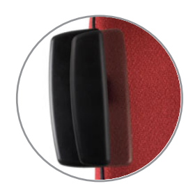
GI armcap slides over top of the seat to narrow the space between the arms.